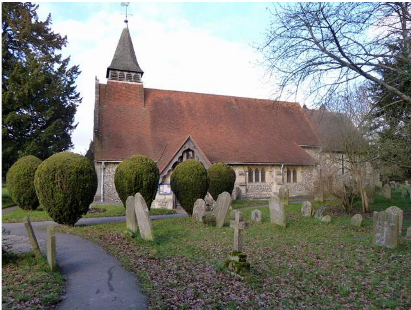
All Saints Church, Warlingham

All Saints Church, Warlingham, Surrey contains 22 Commonwealth War Graves – 15 from World War 1 & 7 from World War 2.